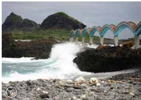
Images: 1. Itsukushima Shrine, 2. Nijo Castle, 3. Gamcheon Culture Village, 4. Changdeokgung Palace 5. Kenting National Park, 6. San-sien-tai, 7. Sun Moon Lake.